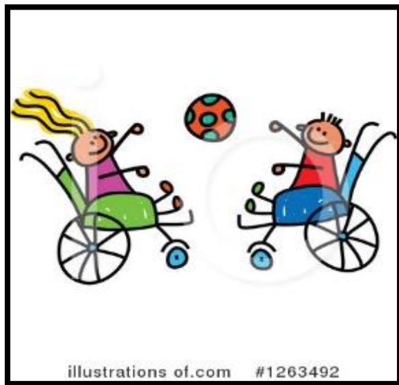
Chair Ball Games

This month we have been focusing on the importance of movement which some brilliant chair exercises, ball games and aerobics going on.